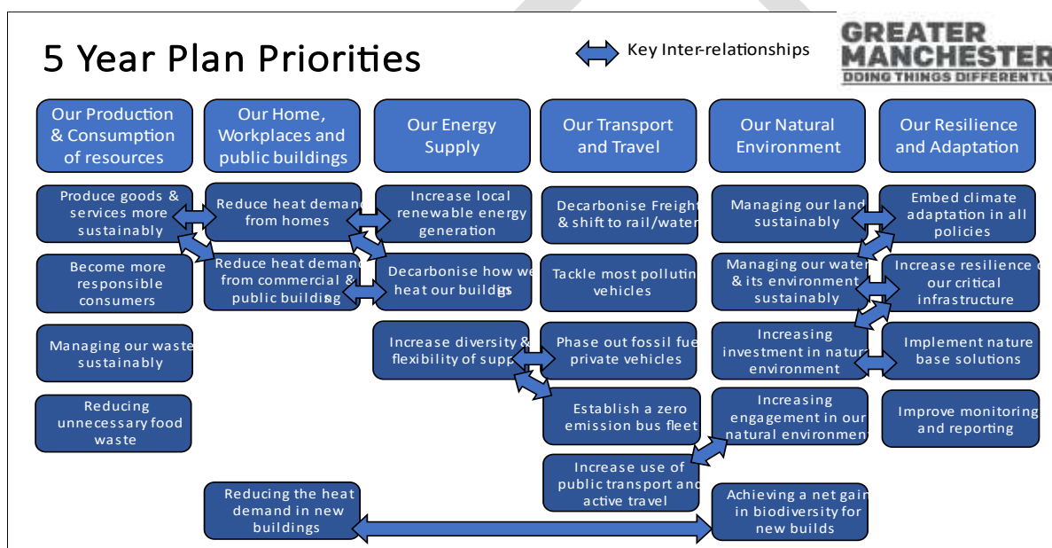
Figure 1: The GMCA 5-year Environment Plan

As part of this approach, Oldham Council will work closely with partners across the local, regional, and national landscape to ensure the ambitious environmental targets set are achieved, and where challenges are identified, we will work closely and collaboratively to overcome them by sharing resources, ideas and leverage the regional strength through the Greater Manchester Combined Authority (GMCA). This includes rationalising the Oldham approach with that of the GMCA; for Oldham, this means that this Environment Strategy will last until 2025, after which, it will be revised and will work to the same timeframe as that of the GMCA Environment Plan. The main aspects of the current 5-year GMCA plan are outlined in Figure 1 , below.